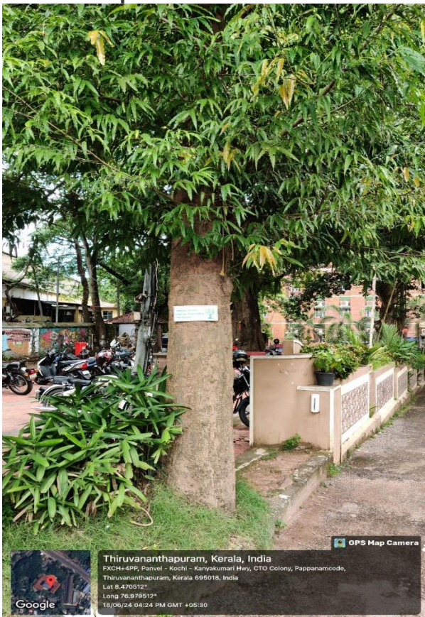
Trees in campus marked with identification tags