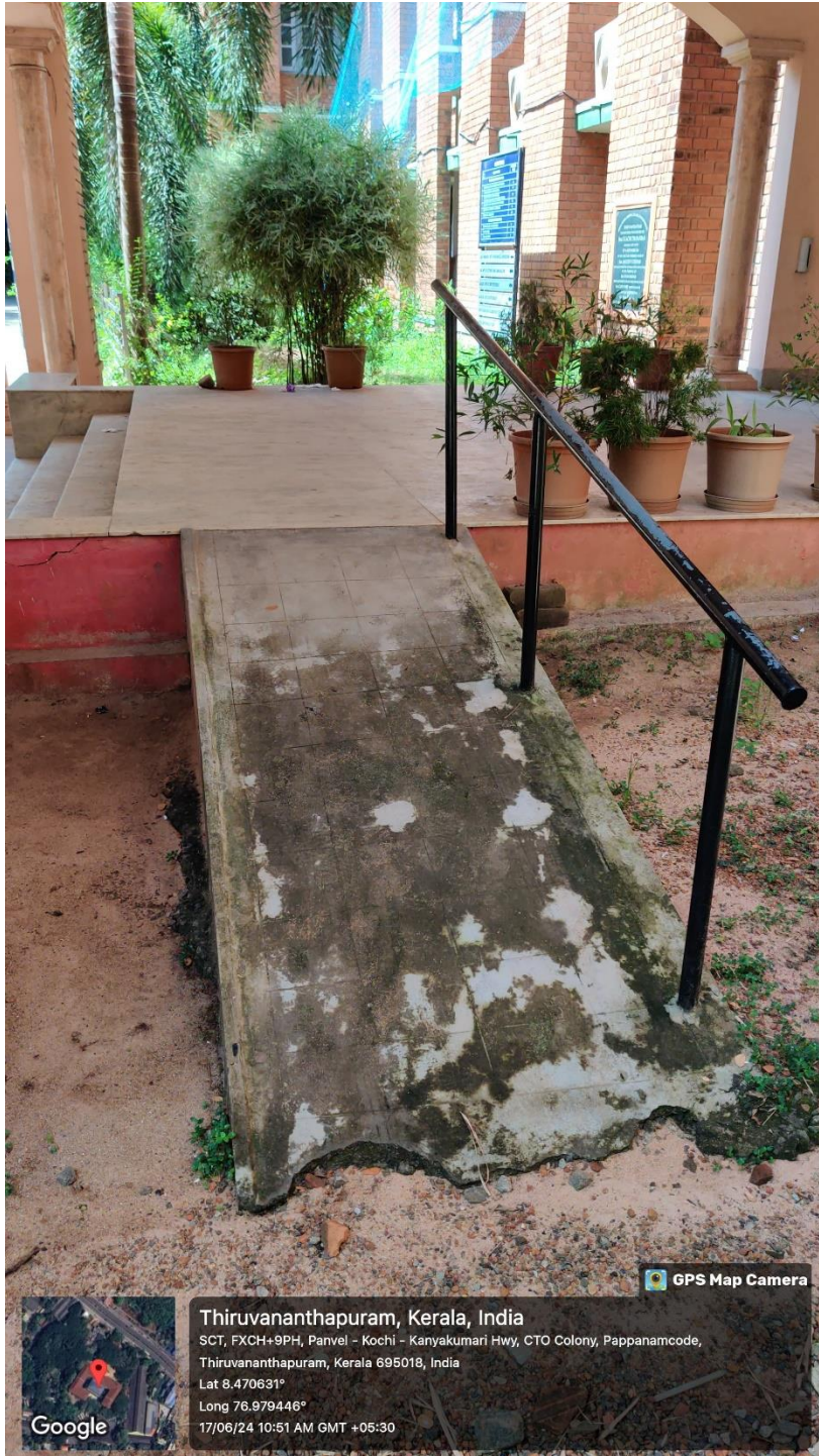
Ramp provided for disabled