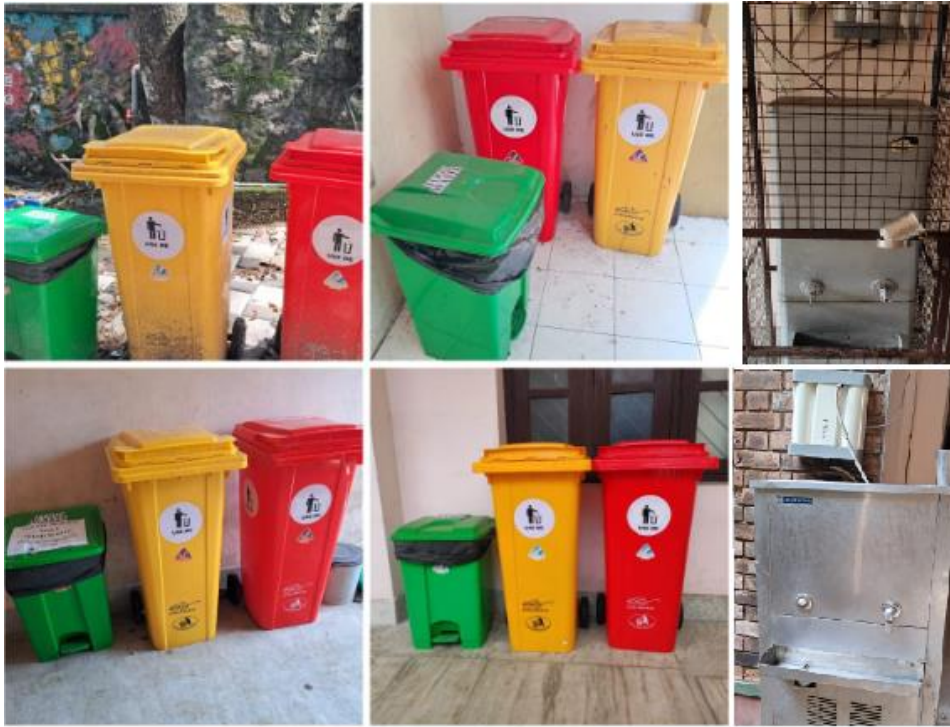
Waste segregation facilities and water dispensers installed at some locations in campus